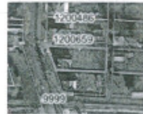
(+) Map this property.

Parcel: 1200003 Owner: GIER DENNIS M ETAL (L/E) GIER THOMAS B & STELLA G Site Address: 210 CANAL ST W NAVARRRE OH 44662-1114 Map Routing Number: 12 024 07 0500 Tax Map: NAV_024.pdf