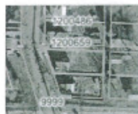
[+] View this property.

Parcel: 1200003 Owner: GIER DENNIS M ETAL (LIE) GIER THOMAS B & STELLA G Site Address: 210 CANAL ST W NAVARRE OH 44662-1114 Map Routing Number: 12 024 07 0500 Tax Map: NAV_024.pdf