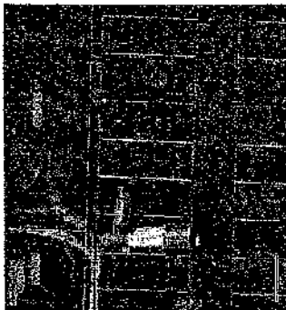
Page 1 - Run at: 3/30/2010

LAND Code: 010 - EXCESS LAND Acreage: 40 Frontage: 100 Depth: 4000 Sq Ft: 40000 Method: FR Rate: 160 $/A Adj %: $0 Value: $6400